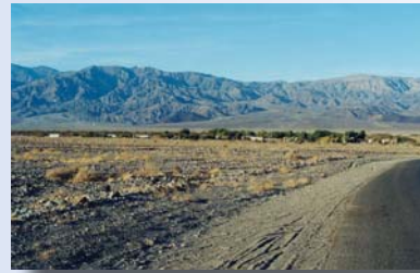
Timbisha Tribal Lands in Death Valley

The Interior Department has certified the Timbisha Shoshones as the first American Indian tribe affected by the government's effort to put a nuclear waste repository in Yucca Mountain.